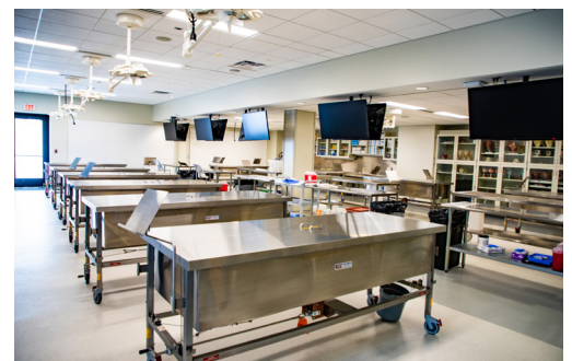
State-of-the-art labs provide our students with experiences that will help them become uncommon practitioners.