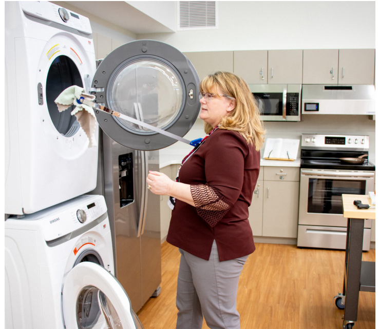
New facilities enable occupational therapy students to learn how to teach adaptive living skills to patients.

Workers tackled more than 7,300 square feet to create an intentionally and expertly designed shared space for future occupational therapy and physical therapy students. The upgrade was on top of significant renovations that the university undertook in 2015 for its School of Nursing and in 2020 for its Master of Science in Physician Assistant Studies program.